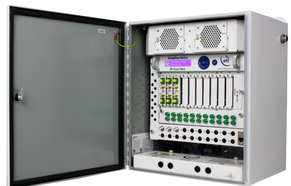
Outdoor Unit (ODU)