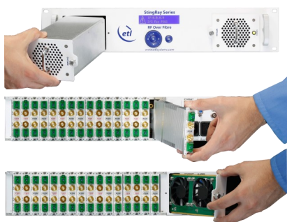
Indoor chassis showing hot-swap power supply modules, fibre modules and fans

Local control & monitoring via front panel push buttons & display